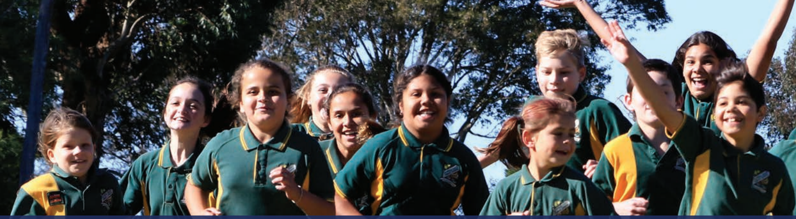
Nowra East Public School