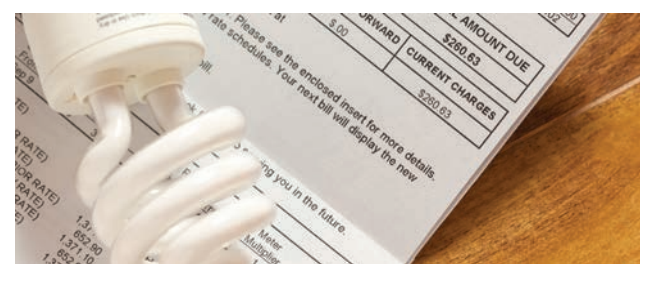
Powering household savings

Reforms reducing stamp duty for first homebuyers have seen more than 43,200 enter the market since the policy began in 2017. Along with other reforms, first home buyers can save themselves up to $34,360 each. We are providing a fairer deal on future property transactions by indexing stamp duty brackets annually to the Sydney Consumer Price Index (CPI) from 1 July 2019.