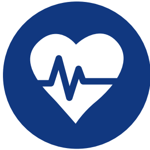
Healthcare 11.4 PER CENT*

There are around 160,000 businesses operating in Western Sydney and the five largest employing industries are: