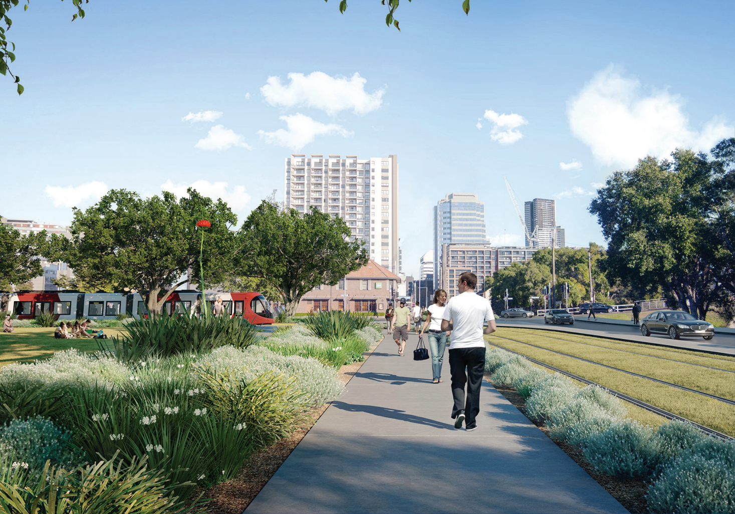
Transport for NSW

The Western Sydney City Deal and the Western Sydney Infrastructure Plan complement other public transport initiatives in Western Sydney, including: