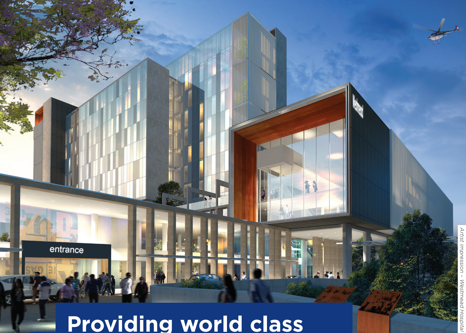
Artist Impression - Westmead Hospital