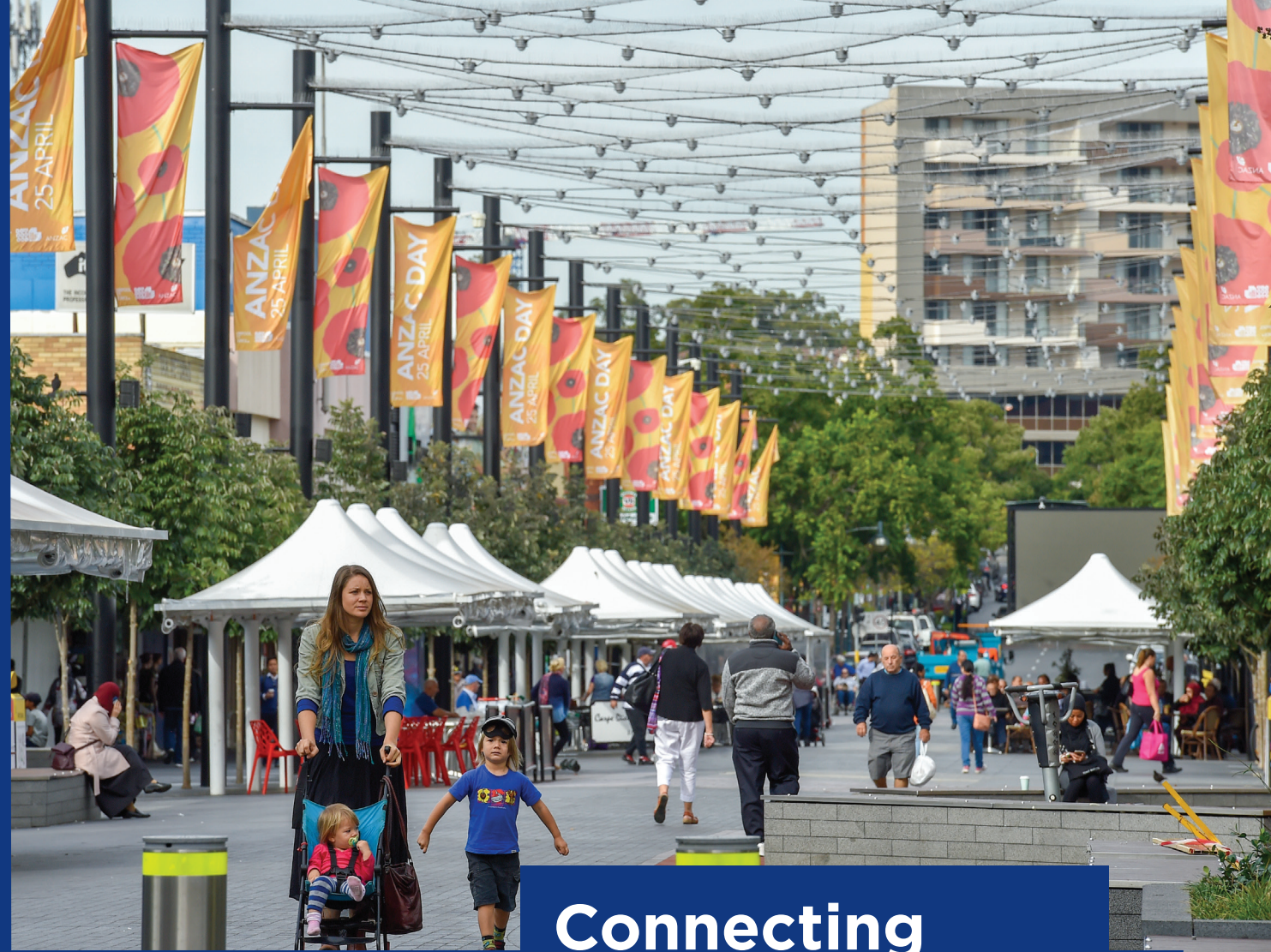
Greater Sydney Commission