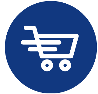
Retail 10.1 PER CENT*