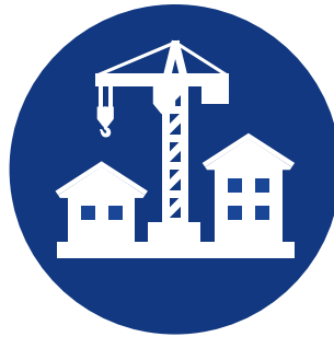
Construction 10.7 PER CENT*