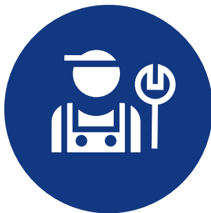
Manufacturing 9.6 PER CENT*