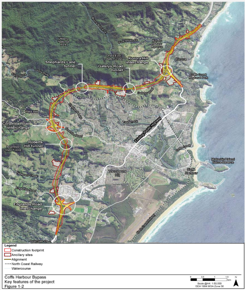
Figure 2.3: Coffs Harbour Bypass