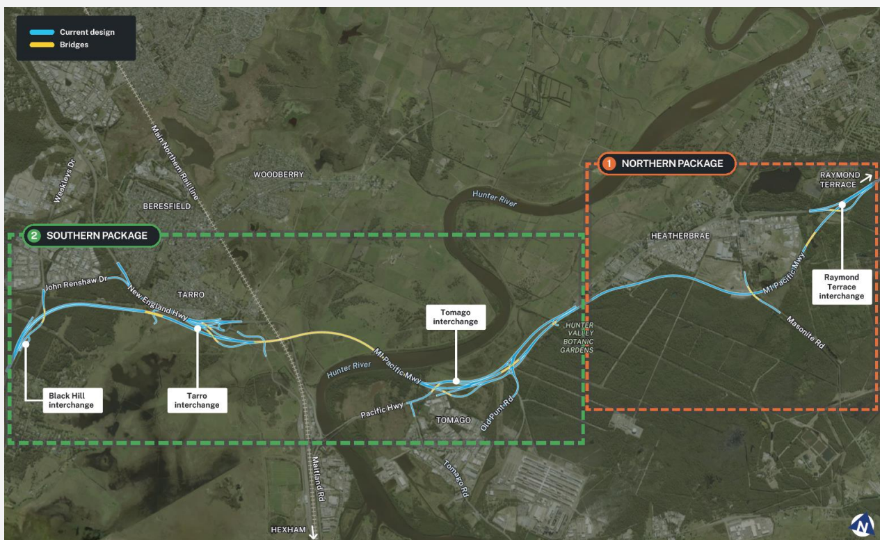
Figure 2.2: Pacific Highway, Extension to Raymond Terrace and Hexham Straight

Final design subject to change following detailed design process