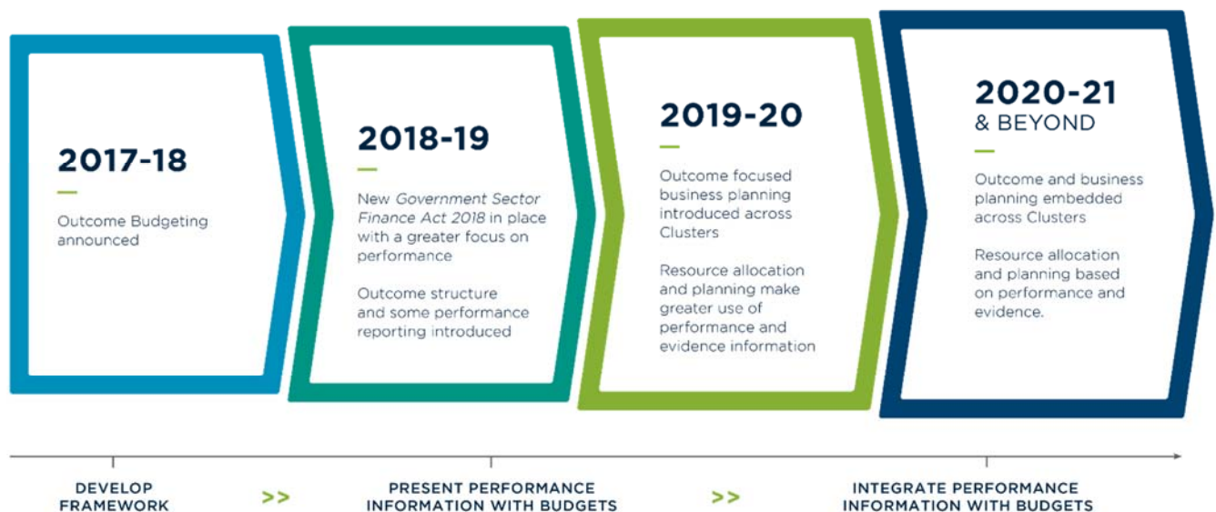
Figure 1: The reform journey

The NSW Government announced Outcome Budgeting in 2017-18 and has progressively strengthened the framework and application across the sector. It was one of four pillars of the 2019-20 Budget and has seen significant development over the year.