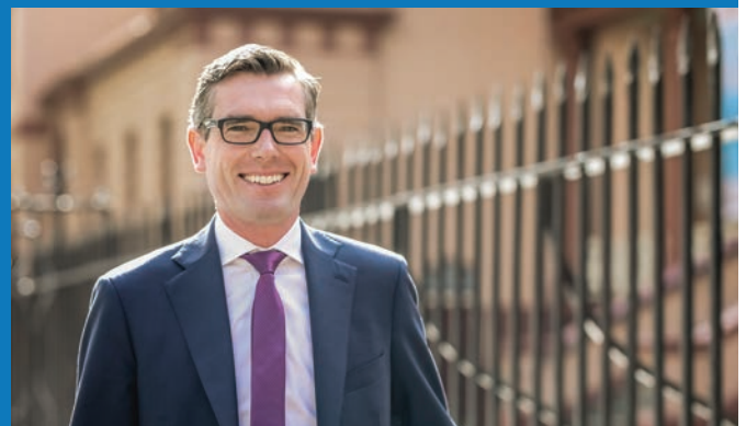
Dominic Perrottet, NSW Treasurer

It's our plan to keep NSW number one, and make our state a better place to live and work for families and communities across NSW.