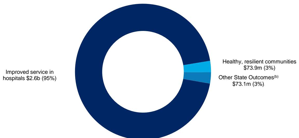
Chart 3.2: Capital expenditure by outcome 2019-20 (dollars and %)

Note: The sum of percentages does not equal one hundred due to rounding.