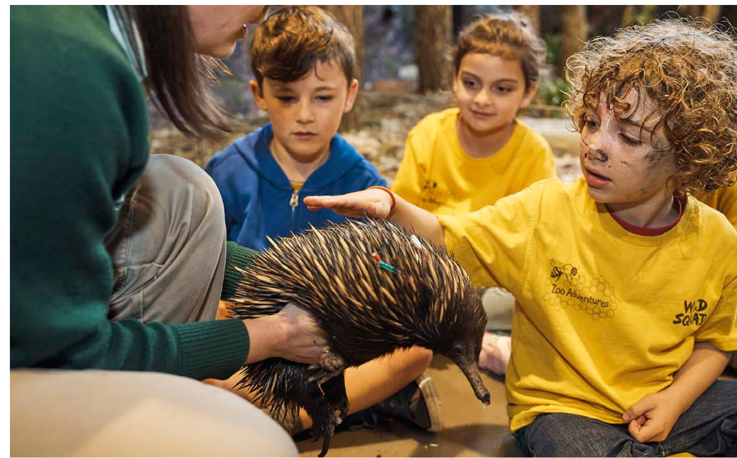
TARONGA ZOO LEARNING HUB CLASSROOM