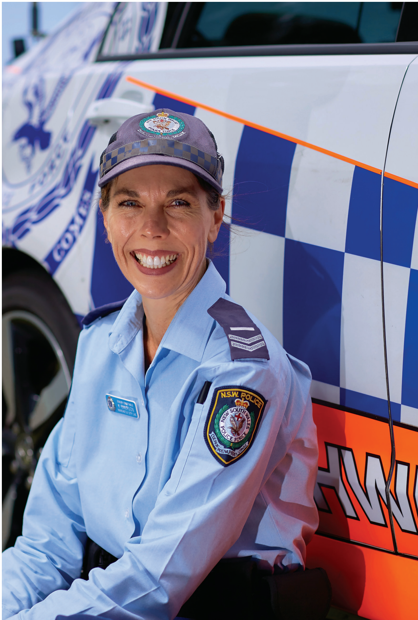
NSW POLICE OFFICER