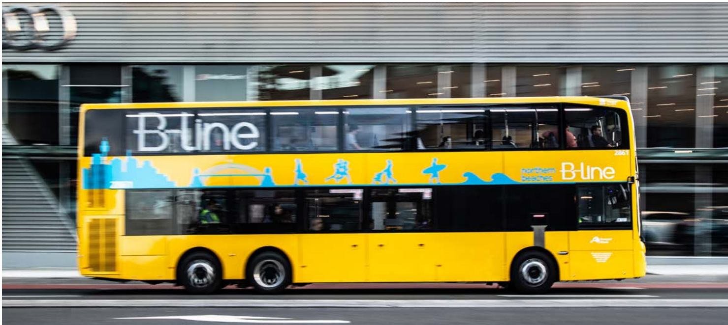
B LINE BUS